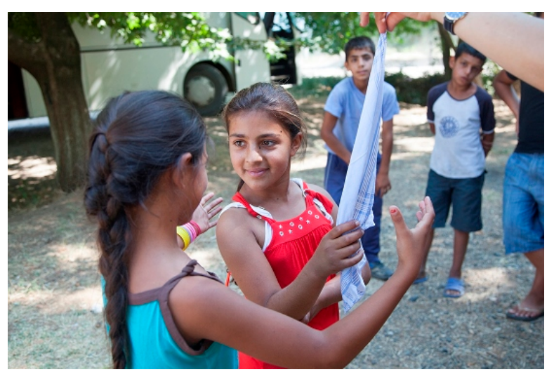
Roma children learning and playing in summer camps organised by Swissfunded Alternated Education and Vocational Training project.

Albania's social safety net has to be strengthened to address the conditions faced by marginalised groups, in particular the Roma. The project integrates Roma children into the education system, provides tools and skills to local social care services, and documents best cases of social inclusion for further replication.