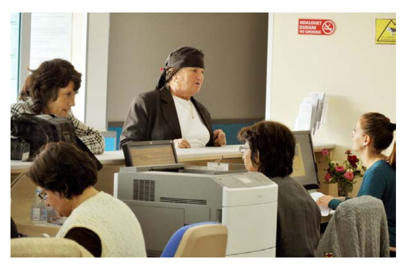
Citizens of Bushat in northern Albania receive information and services at a new one-stop-shop.

Switzerland supports Albania's transition to a democratic society. The decentralisation and local development programme (dldp) strengthens local government in northern Albania and disseminates best practices at the national level. It has introduced new models for local government functioning in areas such as waste management, public finance management, and e-governance.