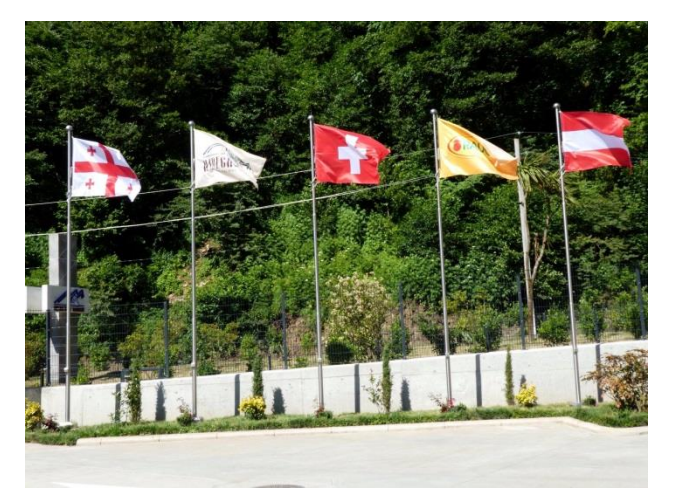
Natural juices from Nabeghlavi