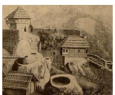
Askana castle, Georgia. F. Dubois

Relations between Georgia and Switzerland date back to the 19th century. Switzerland opened a consulate in Tbilisi in 1883 and maintained it until 1922. One of the first documented contacts was the scientific expedition launched in 1831 by the Swiss archeologist Frédéric Dubois de Montpéreux with a view to exploring Georgia's rich cultural heritage. In the second half of the 19th century, numerous Swiss nationals settled in Georgia. Some were active in the raw materials sector (oil, manganese) while others worked as cheese producers, thus helping to develop the local dairy industry, which again benefits from Swiss support today. In 1888, Swiss alpinists were part of an expedition group that conquered Mount Ushba in Svaneti.