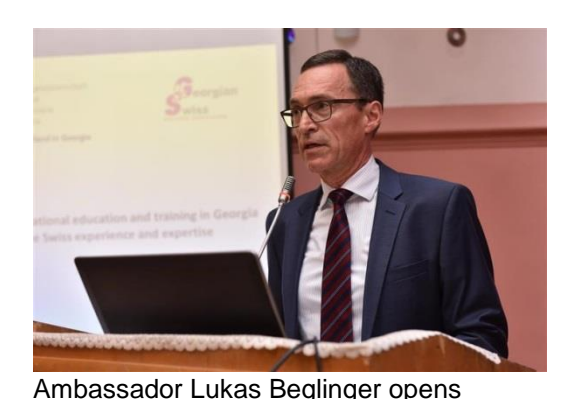
Swiss-Georgian conference on vocational education

Swiss Cooperation Strategy South Caucasus 2017-2020