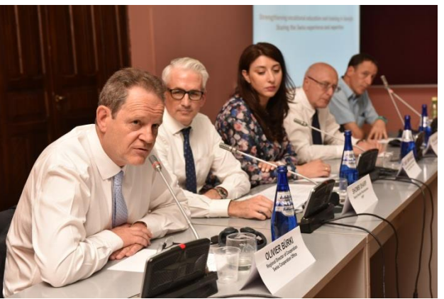
Panel discussion