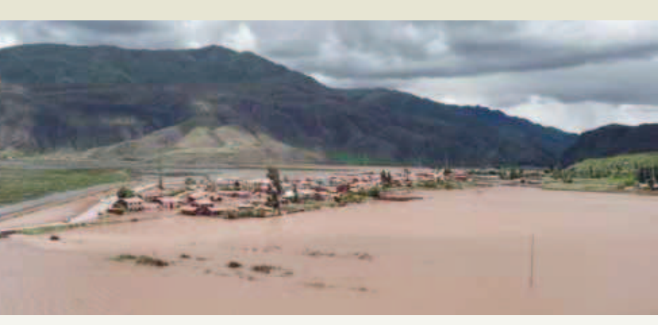
A village flooded in February 2010. Location: Huacarpay, near Cusco, Perú

Both Peru and Bolivia are increasing efforts to address these recurrent disasters and to implement the HFA, mainly through policy dialogue, the improvement of risk governance and by making territorial and investment planning disaster resilient.