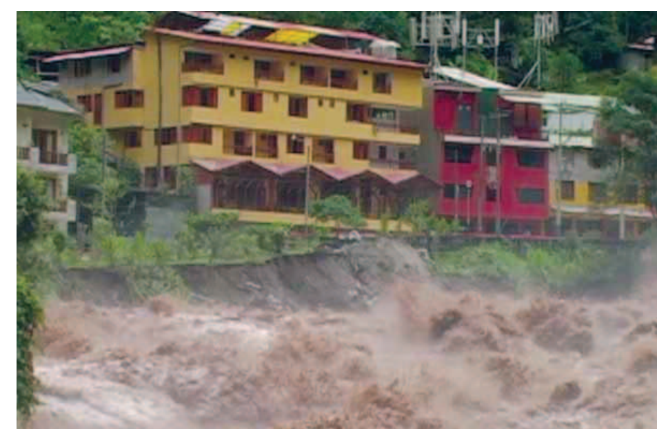
High-cost tourism infrastructure exposed to a mountain torrent Location: Aquas Calientes near Cusco, Perú.

The integrative disaster risk management approach adopted by the project for the promotion of riskconscious planning, the disaster proofing of investments and better preparedness will lead to a significant reduction of disaster losses. Taking the USD 200 million of damage from the early 2010 floods as a typical example of a disaster with a five to ten-year return period, it may be assumed that the adoption of good DRR practices at all levels will reduce such damage by between 5-10% (= USD 10 to 20 million every five to ten years) and corresponds to an annual risk reduction of between USD 1 and 4 million. This rough estimate attributes high (cost-)effectiveness to the initiative, in particular for transport, education and healthcare infrastructure and agriculture. These investments will be more resilient to the next disasters.