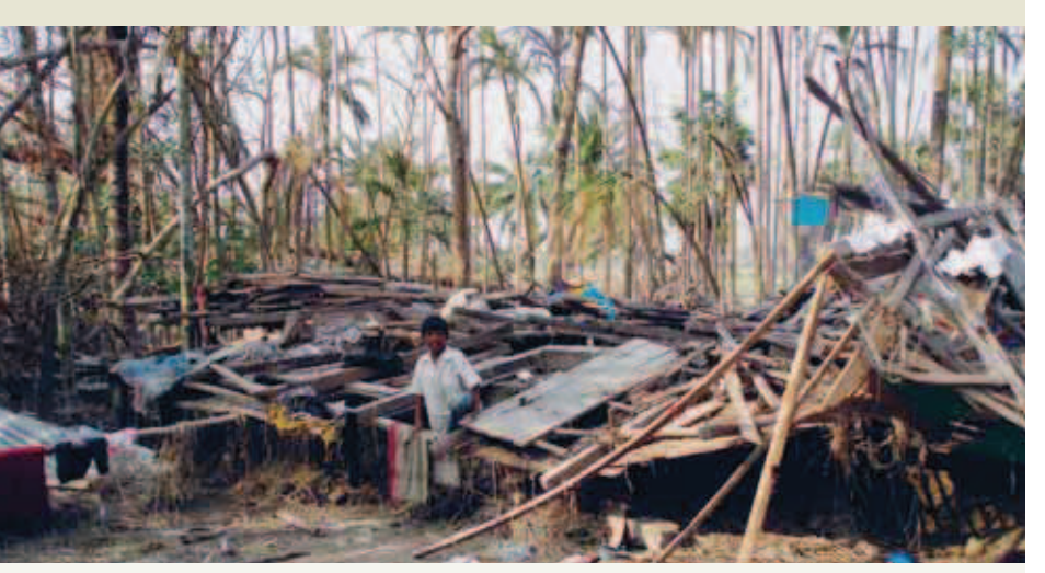
Part of a village destroyed by cyclone Sidr. Location: Upazila Sarankhola, Rayenda Union, Bangladesh.

Changing weather patterns, widespread poverty and its location in a huge delta puts Bangladesh at risk from multiple hazards, including cyclones, floods, droughts, earthquakes, tornados and riverbank erosion. An extreme population density (with a record 1,100 persons per km²) and extreme poverty render the population highly vulnerable to the forces of nature. Against this background, the Bangladesh government is pursuing a shift towards a comprehensive culture of risk reduction as outlined in its National Plan for Disaster Management (2007-2015). In the aftermath of cyclone Sidr in October 2007, the SDC initiated a recovery programme in Bangladesh. The "Community-based DRR Programme in cyclone Sidr affected areas" (CB-DRR) is particularly interesting in this context.