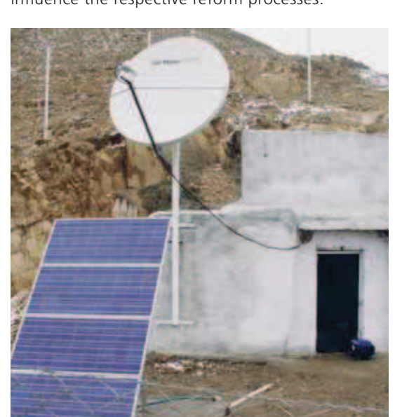
A seismic monitoring station with broadband satellite connection Location: Shartuuz, Tajikistan

upstream from the existing Nurek Dam). However, future risks of failure of these investments are considerably reduced if the structures are built in a way that takes the prevailing seismic conditions into account. Further support for intensified mapping campaigns (standards, methods, finances) is necessary to underscore the aforementioned effects. Only technically sound information in this field will influence the respective reform processes.