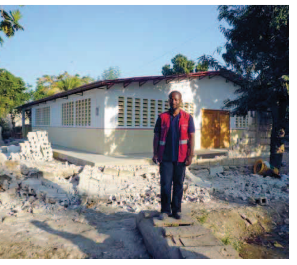
Despite its location approximately 10 km north of the epicentre, this recently renovated school building only suffered minimal damage in the earthquake. A UN assessment team estimated that between 40-50% of the buildings in Gressier were destroyed.

Location: Gressier, Haiti, on 17 January 2010