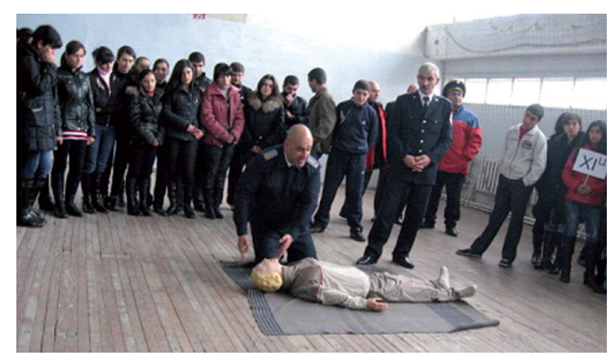
First aid training for school children rising awareness and building capacities