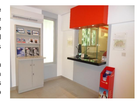
New counter and...

In conjunction with this change in procedures, a new waiting area and an additional counter were built at the chancery. There are now three counters in two waiting rooms, one of which (the newly constructed one, see pictures) is predominantly reserved for Swiss citizens. The new facilities will contribute to improve the Embassy's customer service.