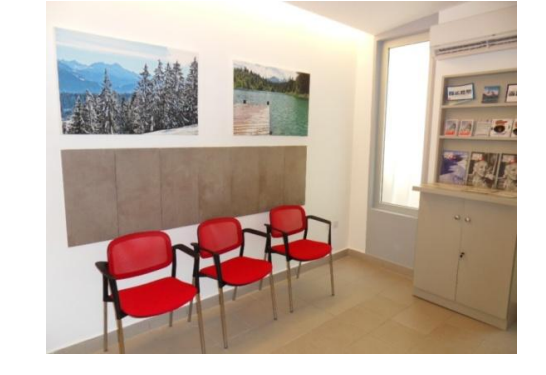
... new waiting area

The Embassy has published further information about VIS on its website: <a href="http://www.eda.admin.ch/eda/en/home/reps/afri/vgha/repgha/swinef.html">http://www.eda.admin.ch/eda/en/home/reps/afri/vgha/repgha/swinef.html</a>