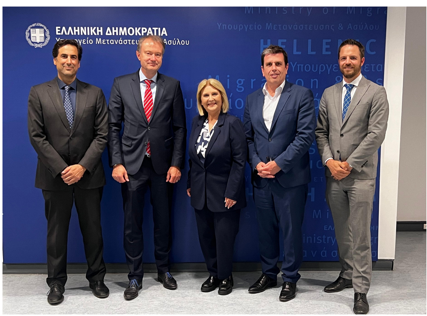
Minister of Migration and Asylum, Dimitrios Kairidis, and Ambassador Stefan Estermann signing the agreement for the "safe areas" project

The project aims to support early integration measures in the labor market for refugees, migrants, and asylum seekers. This approach involves collaboration across state, industry, and social actors. The project focuses on providing education and training, facilitating connections between employers and job seekers, and transferring vocational training expertise from Switzerland to Greece. This multistakeholder approach not only addresses immediate integration challenges but also lays the groundwork for long-term societal and economic benefits, aiming to promote integration and social cohesion.