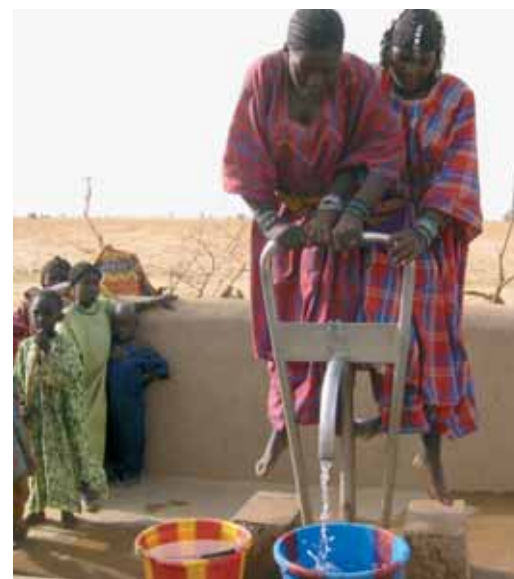
Benefits result especially for women and children

Water programs in remote and poor areas also yielded good results, despite the exclu-