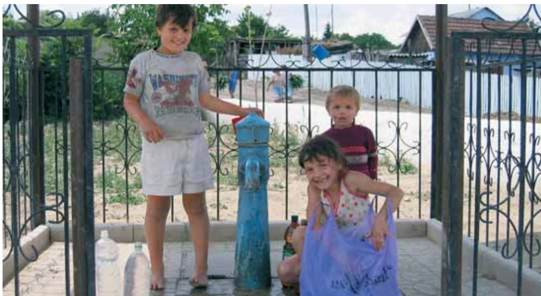
Public water supply site in Moldova

Problems with sustainability are found especially in poor countries, particularly when water rates do not cover actual water