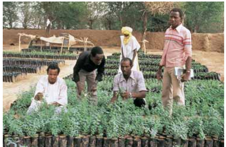
Higher production with irrigation: Tree nursery in Niger