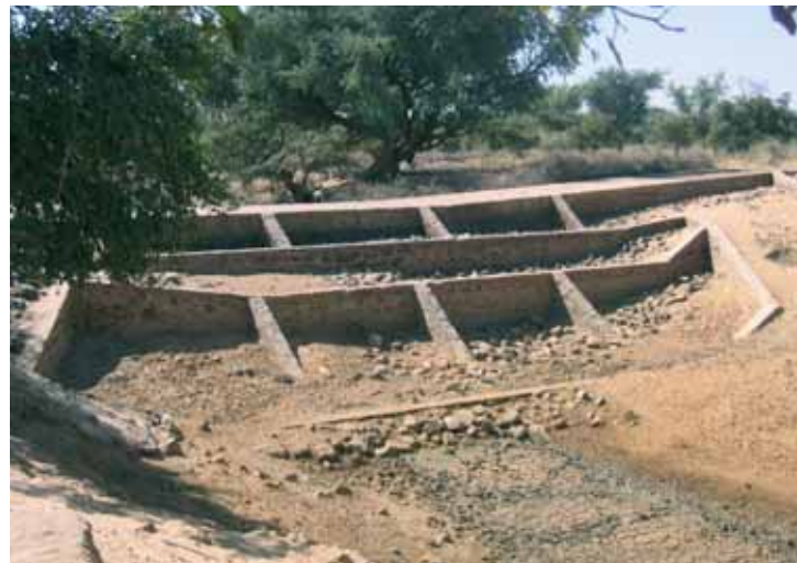
River weirs in the Province of Téra, Niger