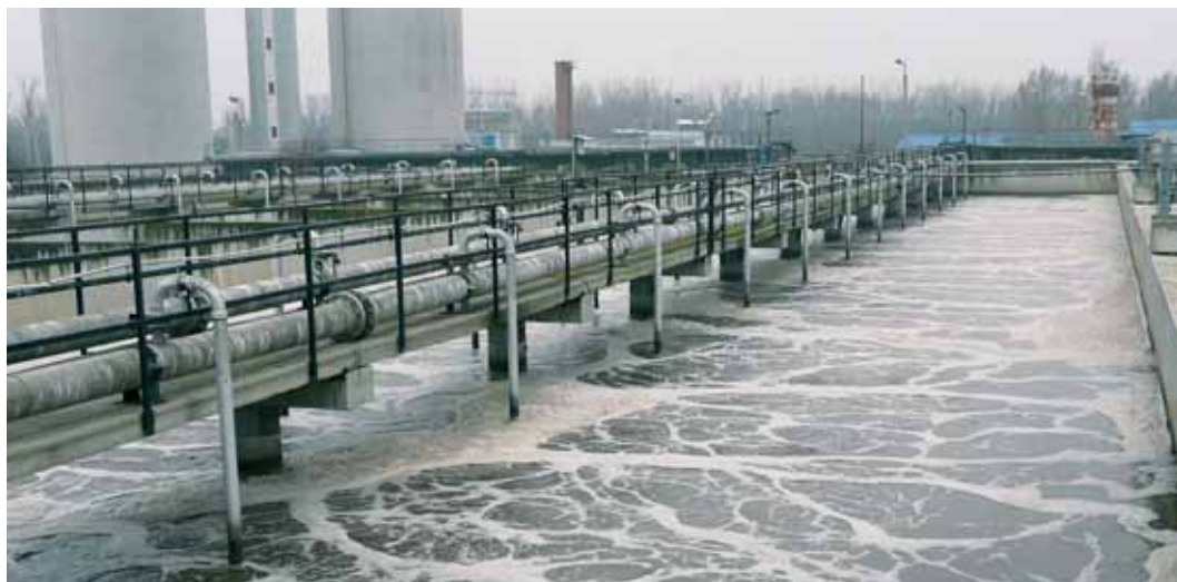
Sewage treatment plant in Debrecen, Hungary