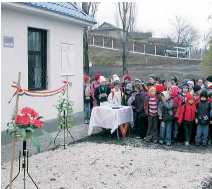
Dedication of a pump station in Moldova

In Mozambique long-term courses and grants were carried out for experts in the water sector. These achieved better results