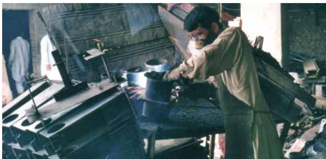
Production of hand pumps by small local businesses, India

A major part of these effects is directly related to good governance. The state was strengthened both locally and nationally so that it can