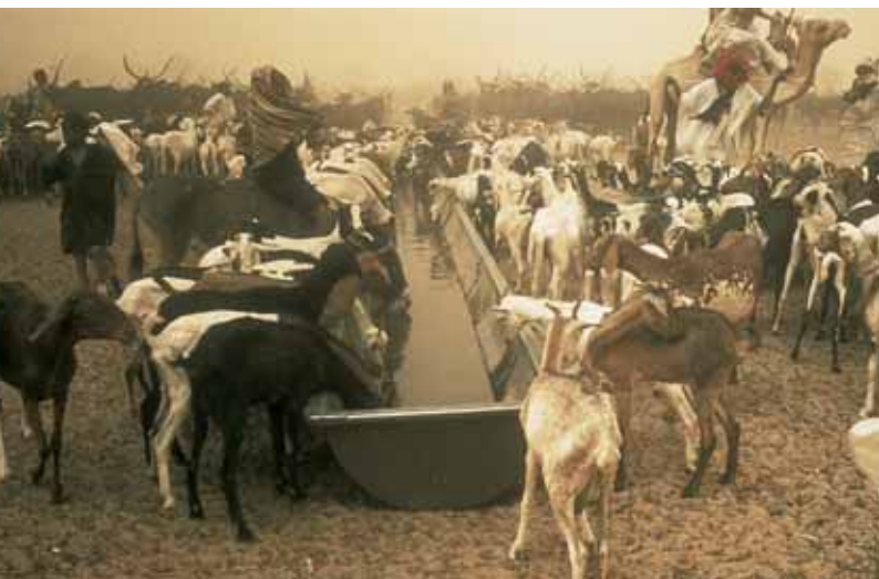
Cattle trough at a water pump in Niger