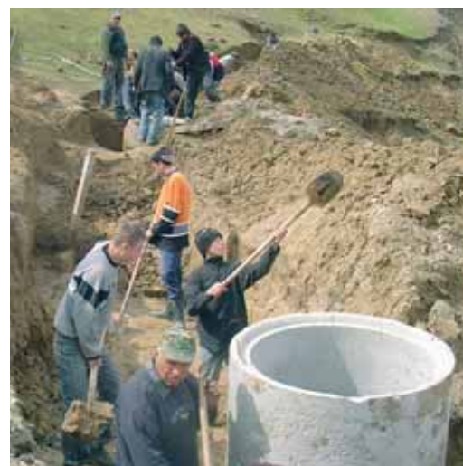
Cooperation of the Moldovan population

Some of these programs have a long history. In individual regions, the Swiss commit-