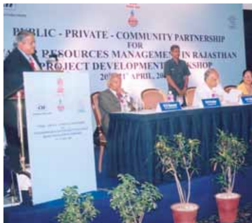
Founding of a public-private partnership in India

Political dialogue has been marked by successes, e.g. ministries for natural resources and the environment were created in Thailand, Malaysia and Vietnam at the recommendation of the Global Water Partnership (GWP),