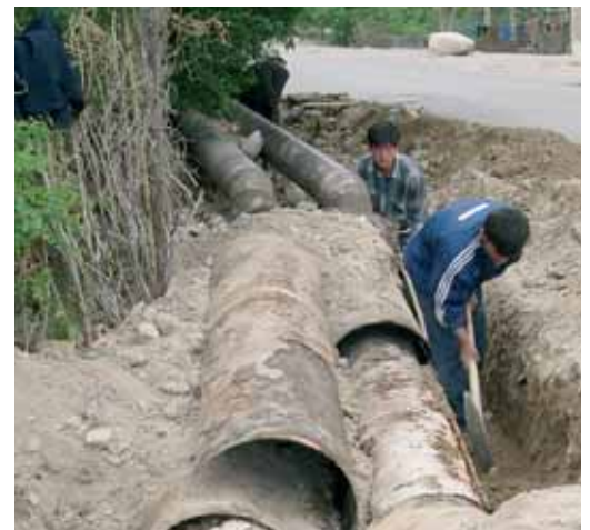
Modification of distribution network in Khujand

In dry regions such as Niger it was possible to increase water availability with some simple measures. In Téra (Niger) weirs were built in the riverbed causing the groundwater level in