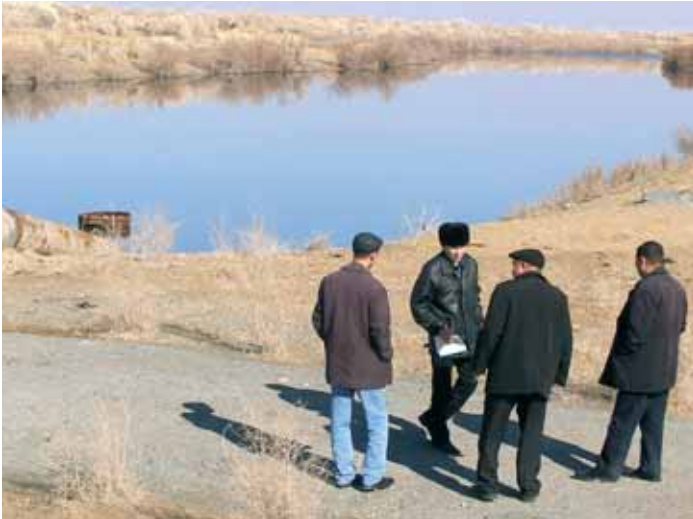
Wastewater clarifiers 30 km outside of Nukus