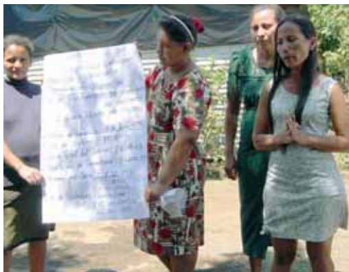
Water committee with female participation in Nicaragua

Experiences in Nicaragua are especially positive. Women now have more of a voice in decision-making, and the construction of school latrines allows girls the carefree attendance of school.