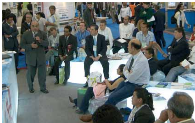
Swiss stand at the World Water Forum in Mexico, 2006

institutions; as well as the implementation of measures.