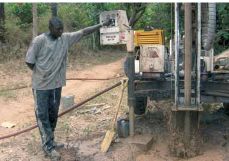
Borehole in Africa

– The Water Supply & Sanitation Collaborative Council (WSSCC) succeeded through