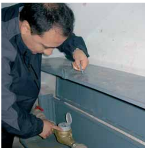
Khujand: Khukand: Water meters are important for equal treatment of users and to encourage payment of bills.

The effects of these Swiss programs can partially influence development trends in a region or city. A totally negative trend (gross development) is not reversible.