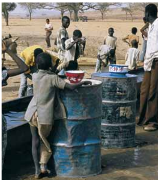
Public water supply site in Niger

Meanwhile, the aforementioned health benefits achieved by the Swiss program in Bangladesh are also endangered. The health of more than 50% of the population is now