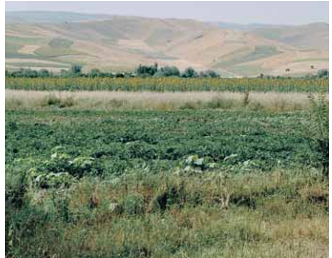
Agriculture in the Ferghana Valley depends on irrigation