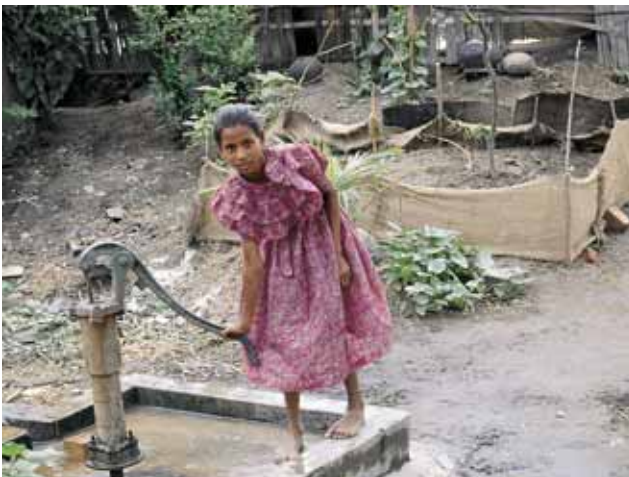
Hand pump in Bangladesh

Moreover, the waste disposal components (sewage water, latrines) in most drinking water programs must be reinforced. This becomes increasingly important as wastewater accumulates with the improvement of the drinking water supply.