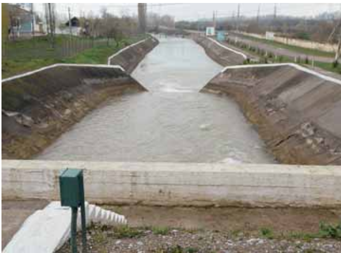
Main irrigation canal in Ferghana Valley, Central Asia

One important finding reached through the work on this report is that any water program supported by Switzerland must be better organized when it comes to collecting data on access to water and documenting results.