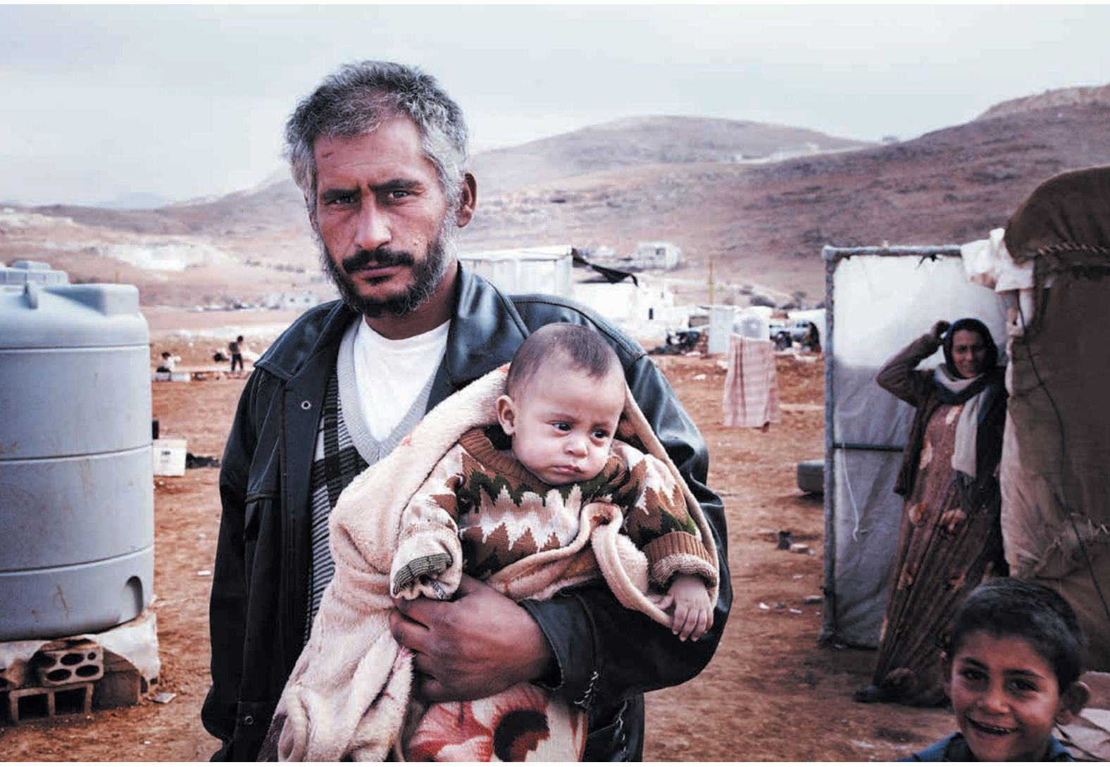
© Leila Alaoui / DRC 2013