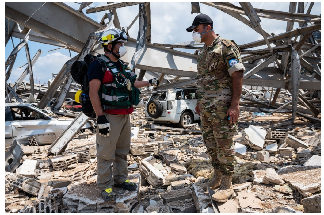
Swiss Hazmat expert searching the site for toxic substances in conversation with an expert of the UN