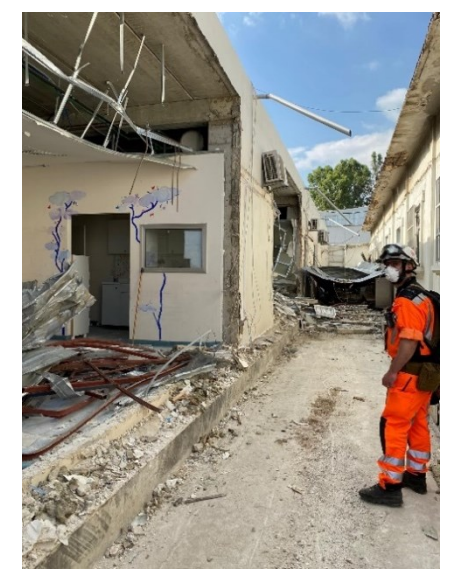
SHA expert assessing a building