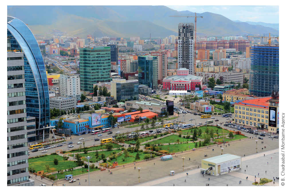
SDC will provide support in clarifying the functions, finances and responsibilities of soums, khoroos, districts and the capital city.

Decentralisation is high on the Mongolian government's agenda. With the adoption of a number of new laws, Mongolia has made significant progress in both administrative and fiscal decentralisation reform. Switzerland is supporting Mongolia's reform efforts, and is sharing its experience and expertise in decentralisation and democratisation.