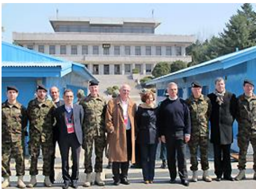
▶ Federal Councillor Burkhalter with his spouse and Swiss delegation

Both sides also welcomed the intensification of our political contacts and last year's resumption of a political dialogue between the two Ministries. Other areas for more intensive co-operation are Green Growth: a partnership of Switzerland with the Global Green Growth Institute (GGGI) in Seoul is planned.