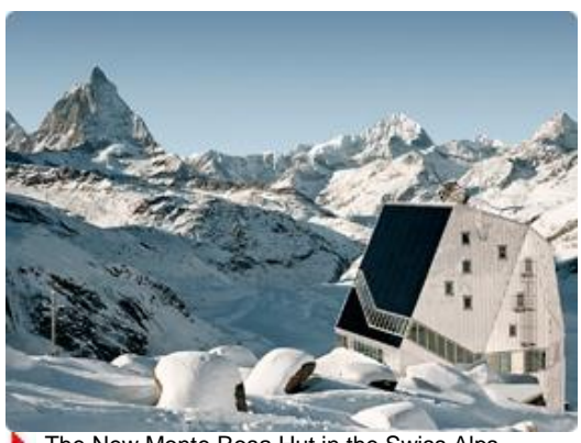
The New Monte Rosa Hut in the Swiss Alps

On May 16th, the Swiss Embassy together with Yonsei University invited to the opening ceremony for the exhibition on the New Monte Rosa Hut. The New Monte Rosa Hut is a spectacular sustainable building in the Swiss Alps (2883 m above sea level). The alpine shelter, which can house up to 120 hikers and climbers, produces 90 per cent of its electricity from the sun thanks to an ultra-modern photovoltaic system integrated into its façade. The water is produced from melting glaciers, then collected and stored in a large reservoir 40 metres above the hut.