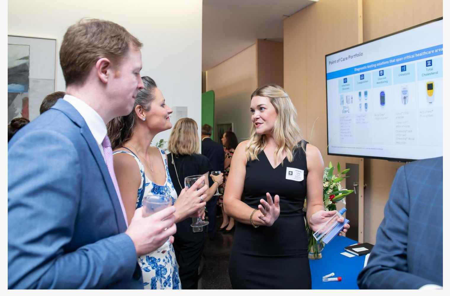
At the Roche activation, guests learned about recent innovations in diagnostics and digital healthcare solutions.

Roche is rewriting the narrative of healthcare through groundbreaking advancements and steadfast dedication. A global pharmaceutical company with a legacy spanning over a century, Roche has consistently pushed the boundaries of science to improve and extend the lives of millions worldwide in the face of the world's most critical medical challenges.