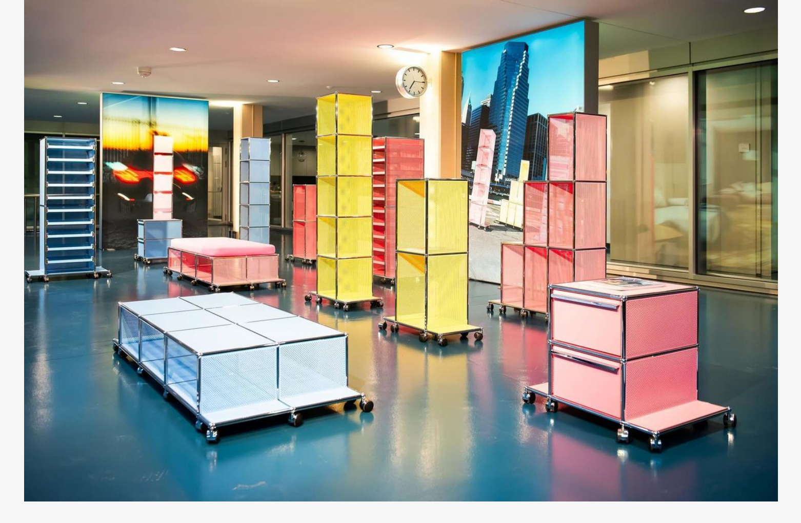
A timeless classic in new shapes and colors: Ben Ganz's limited edition USM Modular Furniture collection.

Switzerland is not only known for its attention to detail and craftsmanship in industry; since the 1950s, Swiss design has become a beacon of minimalistic and sophisticated style. USM Modular Furniture serves as an excellent illustration of modern Swiss aesthetic sensibilities.