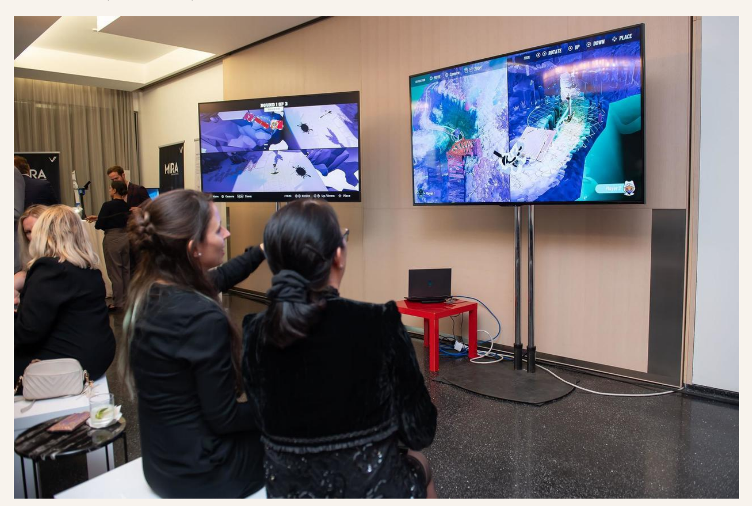
Let the games begin: Ninoko offered an exclusive preview of its upcoming multiplayer game.