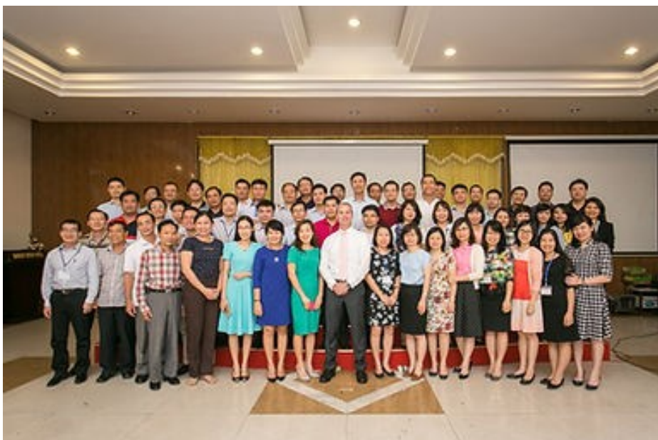
Caption: 77 bank executives attended the Phase II of the Program (2015 – 2017)

Until mid-June 2022, close to 100 applications from executives from some 15 Vietnamese banks have been submitted, showing the high interest among banks and executives. The Swiss BET Program will improve bank management capacity and strengthen the financial sector in Vietnam. In addition, it is also an excellent opportunity to raise the profile of Swiss banking in Vietnam.