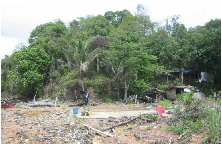
In Thailand a considerable amount of infrastructures along the coast was destroyed. Most affected were fishing villages like on the islands of Ko Phra Thong and Ko Kho Khao.

Swiss Agency for Development and Cooperation SDC