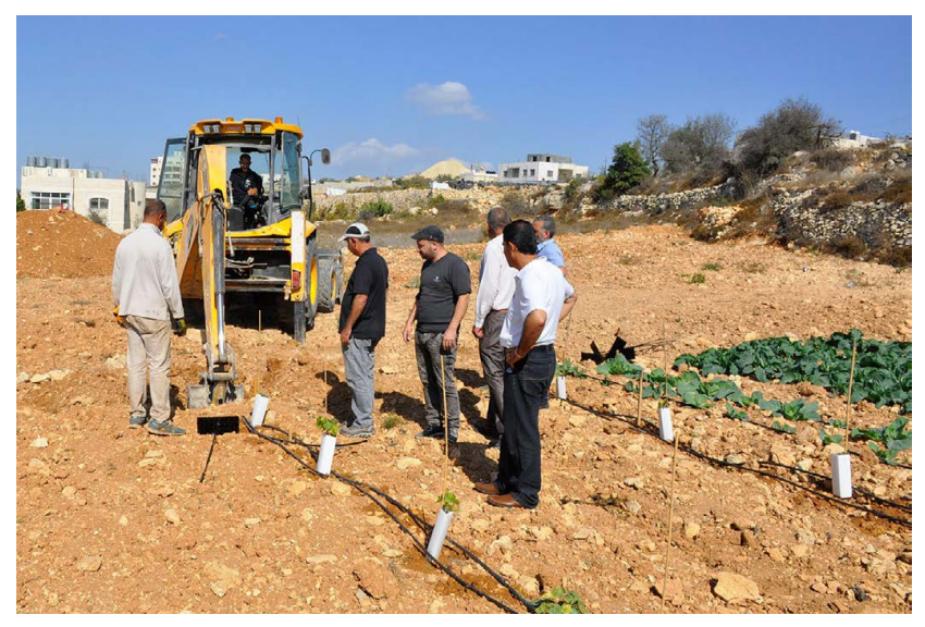
Halhul new grapes variety

Agriculture remains one of the main pillars of the Palestinian economy in light of its contribution to food security, employment and export revenues. Currently, the agricultural sector is reported to operate at a quarter of its potential: the main constraints to increase agricultural production in the occupied Palestinian territory (oPt) derive from the consequences of the Israeli-Palestinian conflict.