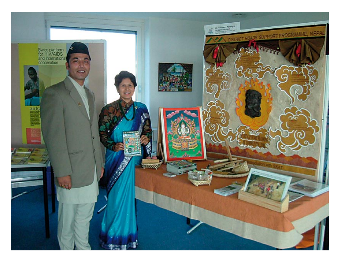
The winners of the "Stories for Sustainability" Award show their products at the Dare to Share Fair in 2004