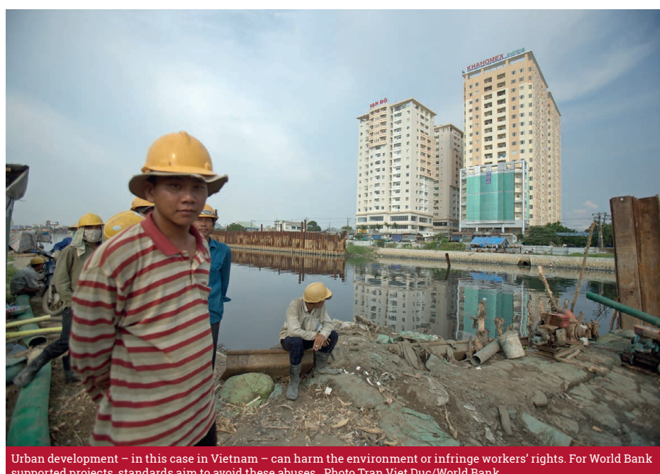
supported projects, standards aim to avoid these abuses.

The world's leading development institutions prescribe protective measures designed to manage the social and environmental impact of the projects they fund. The World Bank has recently reviewed its safeguards. The result: retrograde changes for some, progress for others.