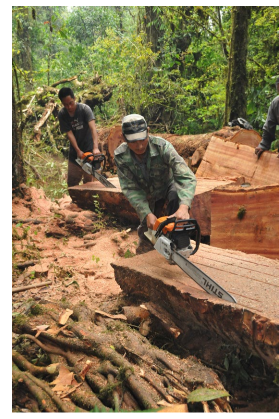
Two CFMG members saw planks for the renovation of a house in their community (Tsirang District)

A third and final phase of the project is currently under development. It aims at enhancing the benefits to livelihoods of community forestry and at contributing to improved local governance and the sustainability of community forestry in Bhutan. An important element of sustainability is the fostering of more exchanges between community groups, which could pave the way to the creation of more institutionalised networks of community forestry groups.