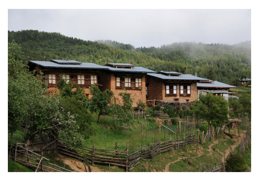
A typical rural community in Bhutan embedded in its community forest (Shingyer Village in Bumthang District).

The government came to realise that sustainable forest management could only be achieved with the local people: "People's participation is key to conservation and the utilisation of forest resources", stated a royal decree in 1979. This recognition prepared the ground for a step-wise, albeit slow, paradigm shift towards a more decentralised and people-centred approach to forestry, and the government started developing approaches to involve local people in forest management again. One of these approaches is community forestry.