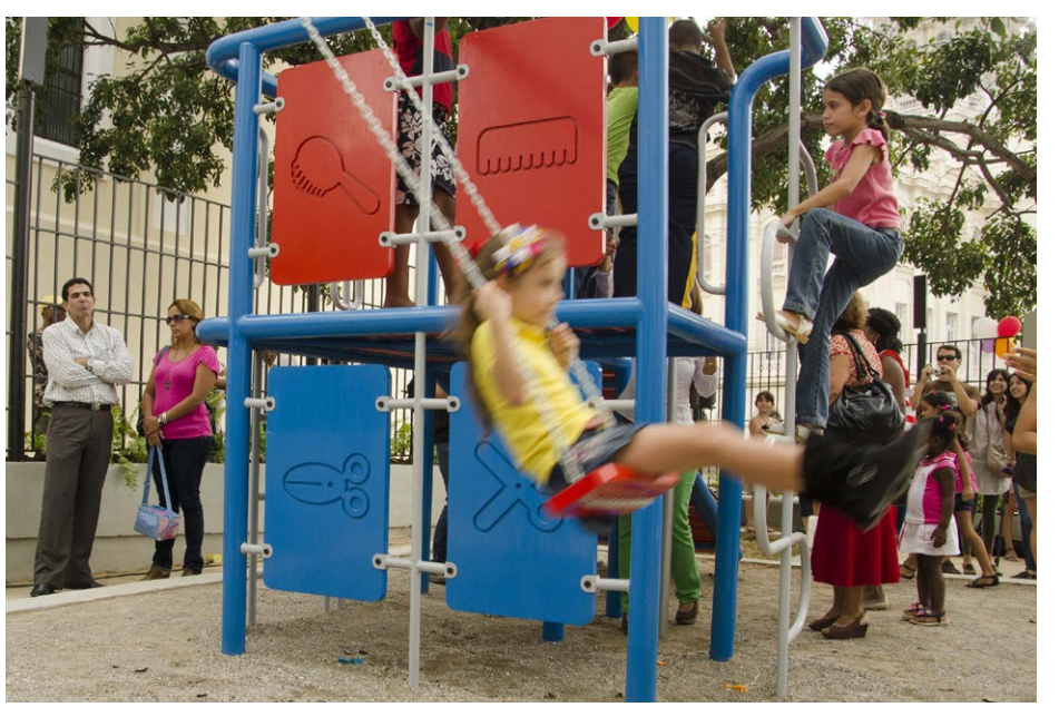
"You can't just restore the buildings and not also invest in the people".