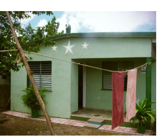
A house recently constructed using local resources within the framework of the PRODEL project, Aguada de Pasajeros.

"The technology that CEDEL provided us with has enabled us to create a strategy that considers the municipality as a whole, based on an updating of the management plan. Thanks to that, today we have a field study at our disposal that we didn't have before: we were working with next to no information whatsoever. Once you've got your management plan more or less right, you can find the answers to all of your municipality's problems. In it you will find the positions of the population with regard to housing, transport and technical infrastructure. The development of the plan began using participatory methodology with a series of workshops. That was followed by various exchanges with the municipal administrative board, draft versions of the plan, and finally approval by the municipal assembly. It was a long, complicated process."