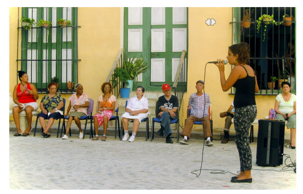
Activities for the elderly organised by the Casa del Abuelo home for the elderly and the Artecorte project in Havana.