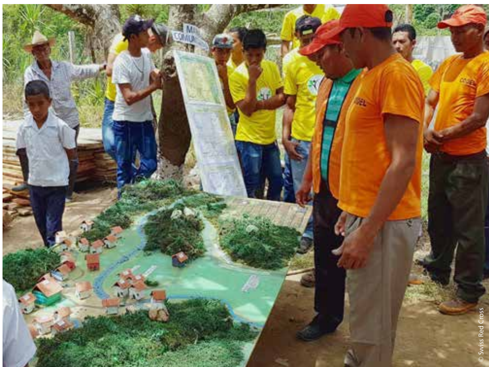
Community training on hazard assessment, Olancho / Honduras 2019

Central to this community-based disaster risk reduction approach implemented in Olancho is the focus on community committees, they are organized, trained, equipped, brought to official recognition and linked to the national Disaster Management system. Further main building blocks of the interven-