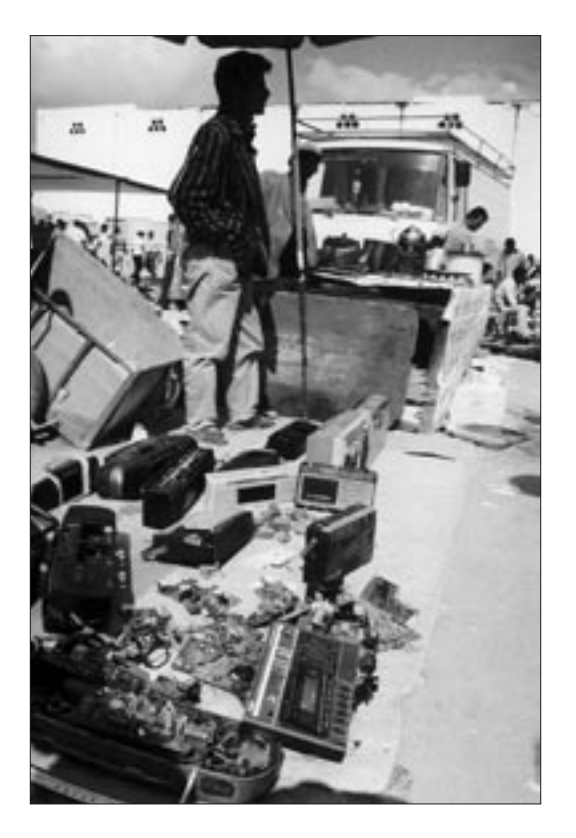
Second hand radio spare parts are attractive items for sale on a market in Central Asia (Kyrgyz Republic).

and rights are different clients in service delivery. Citizens who cooperate in an organised way at the village level or nationally, like the Self-Employed Women's Association (SEWA), gain leverage in public and political processes. The use of ICT to strengthen poor people's voices is not primarily an e-government project; it rather serves to strengthen civil society in pressing for a