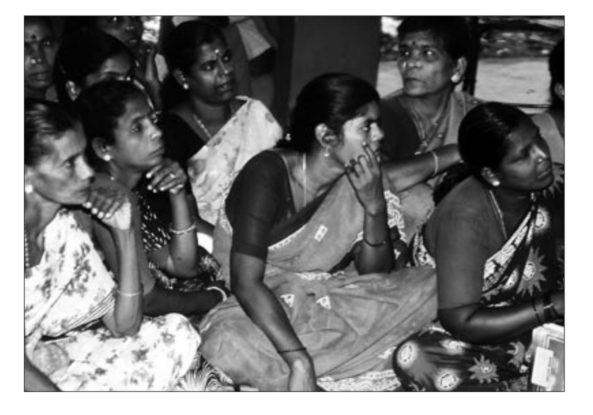
ICTs have to serve the people. A village meeting of the knowledge centre (India).

of poverty, such as health or education. They need, however, to be viewed together, as they are mutually reinforcing and aim to reduce poverty in all its forms.