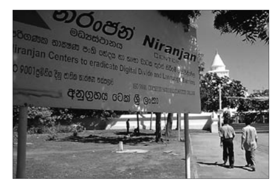
A centre to "eradicate the digital divide" in front of the Kataragama milk temple in Sri Lanka.

again, though not by as much as for fixed lines. The ITU proposed that the role of the state is the critical factor in explaining the difference in performance: For historical reasons, the government is usually closely involved in fixed-line telecommunications (through state-ownership of incumbents and regulation). It is not so involved in mobile communications, where the private sector usually plays the dominant role, typically in a more competitive environment. Internet is half way between