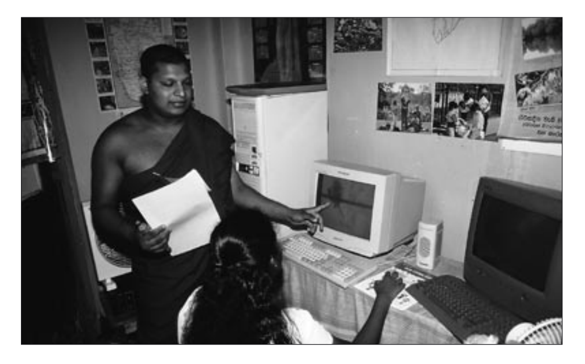
A Buddhist monk teaches users how to handle the computer in a village information centre of the Sarvodaya Shramadana Movement in Sri Lanka.

tory as long as mankind itself. However, with the advent of new technology, namely digitalisation, ICTs have gained a more prominent status and are now sometimes divided into "old" and "new" technologies, relying more or less on this technical distinction<sup>17</sup>. This paper defines ICTs as technologies that facilitate communication and the processing and transmission of information by electronic means<sup>18</sup>- digitalisation, therefore not being the criterion. This recognises the fact that currently the most widespread ICTs are not digital technologies, since radio and TV use primarily analogue techniques<sup>19</sup>. And, especially in relation to poor people, these media have a significant potential and impact<sup>20</sup>. Technological convergence brings new devices onto the market that will gradually render the distinction between old and new ICTs obsolete.