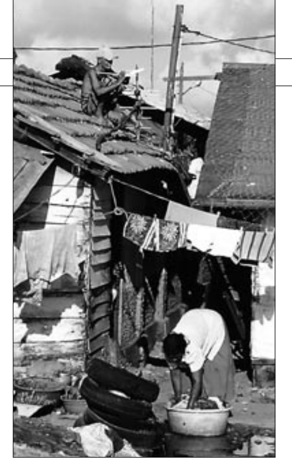
A TV-antenna is being repaired in a slum area (Sri Lanka).

the commercially viable parts separated from the economically non-viable but public interest parts (microfinance pattern!)?