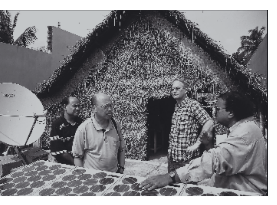
A staff member of the MS Swaminathan Research Foundation explains the hub of the village information network in Villianur (India) to a part of the Chennai Group. It is based on solar energy and satellite links.

ICTs can make a difference in poverty reduction. The lessons learned around the globe demonstrate the great potential of ICTs to enhance empowerment, opportunity and security. This potential contrasts with the overall modest impact of ICTs on the MDGs. Untapped opportunities exist for scaling-up poverty reduction using ICTs.