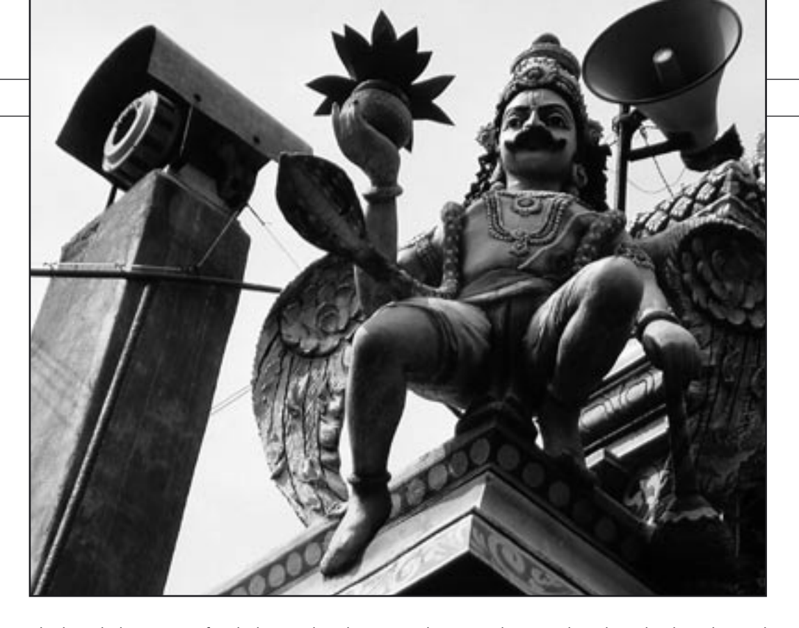
The knowledge centre of Embalam (India) does not only use modern ICTs but also a loudspeaker and sirene, fixed to the temple roof.

Third, the education system may aim at creating a knowledge society and perceive ICTs as a tool for lifelong learning. The teacher's role shifts from being primarily an information provider to that of helping learners manage and interpret information.<sup>126</sup>