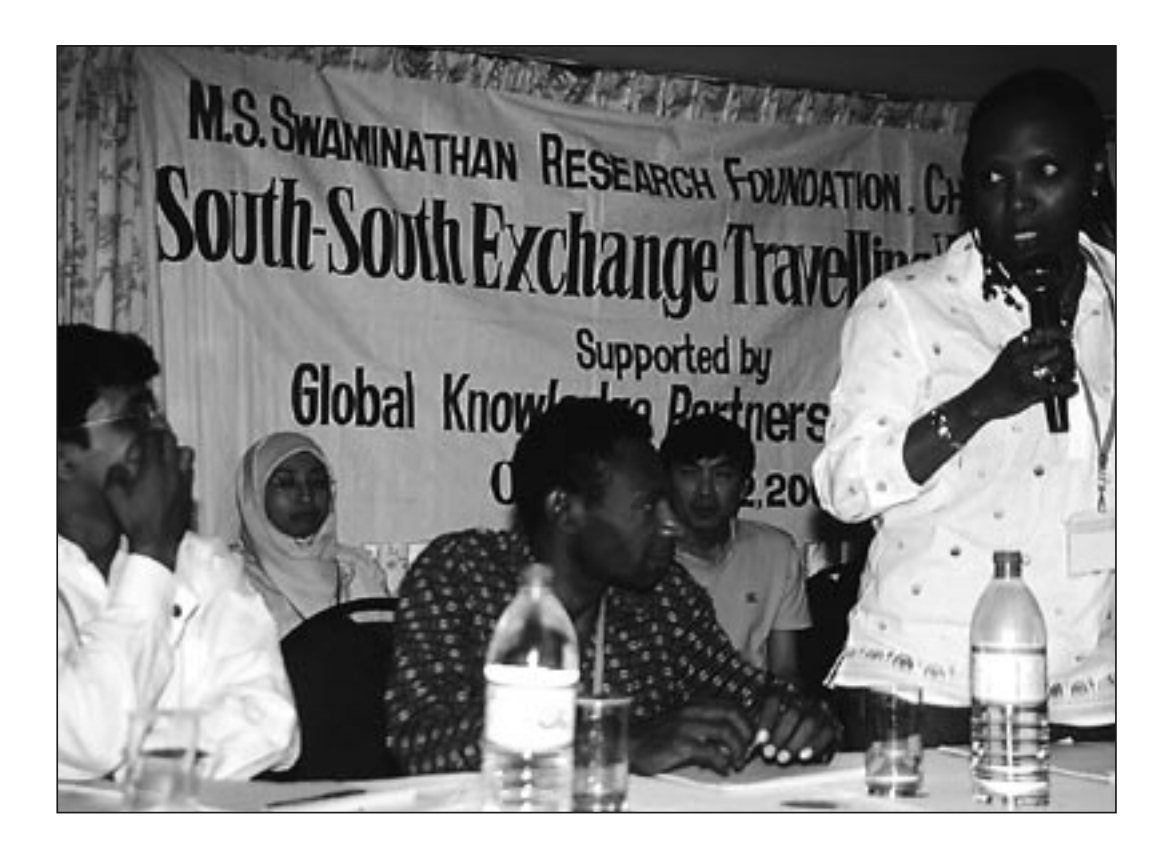
The MS Swaminathan Foundation organises South-South Exchange Travelling Workshops on ICTs meeting the people in the villages.

sector in general and for social entrepreneurs in particular, to bring connectivity, services and content to those in poverty.