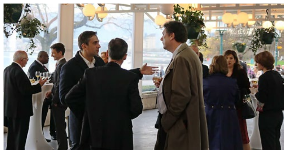
Exchange between CSOs - electoral management.