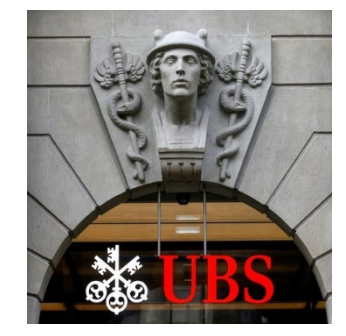
Reporting on major Swiss banks is mostly illustrated with stock images