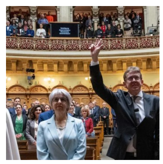
Pictures of the swearing-in ceremony of the new members of the Federal Council.