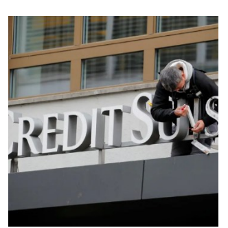
All is no longer well at Credit Suisse, suggested the New York Times with this picture.