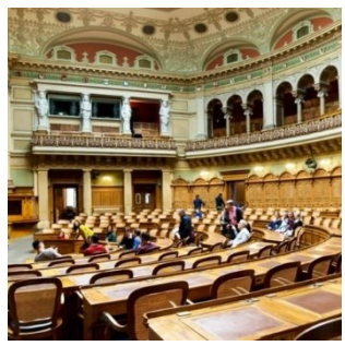
Coverage of the Federal Council replacement elections also sparked interest in Switzerland's political system.