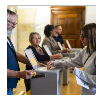
A woman casts her vote in the federal parliamentary elections at a school in Delémont on 22 October.