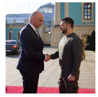
Ukrainian President Volodymyr Zelenskyy welcomes Swiss President Alain Berset during his visit to Kyiv in November.

The drafting of a negotiating mandate for talks with the EU, announced by the Federal Council, and the actual adoption of the draft in December were initially covered in the foreign media in a concise and factual manner. Later, some foreign media outlets reported on the intended resumption of negotiations in more detailed individual commentaries of varying tone.