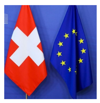
Switzerland broke off the last negotiations with the EU in 2021. Now the Swiss government and the European Commission want to try again.