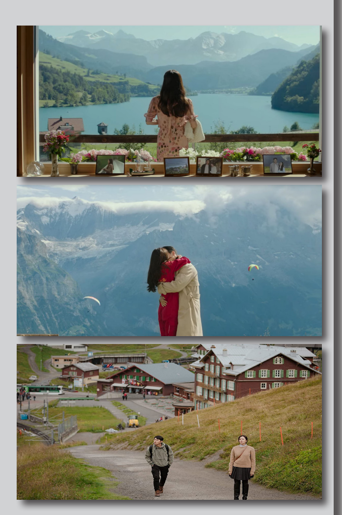
Figure 2: Switzerland as a desirable destination – in 2020, it features particularly in Asian productions (left: Switzerland ; right: Crash Landing on You ).