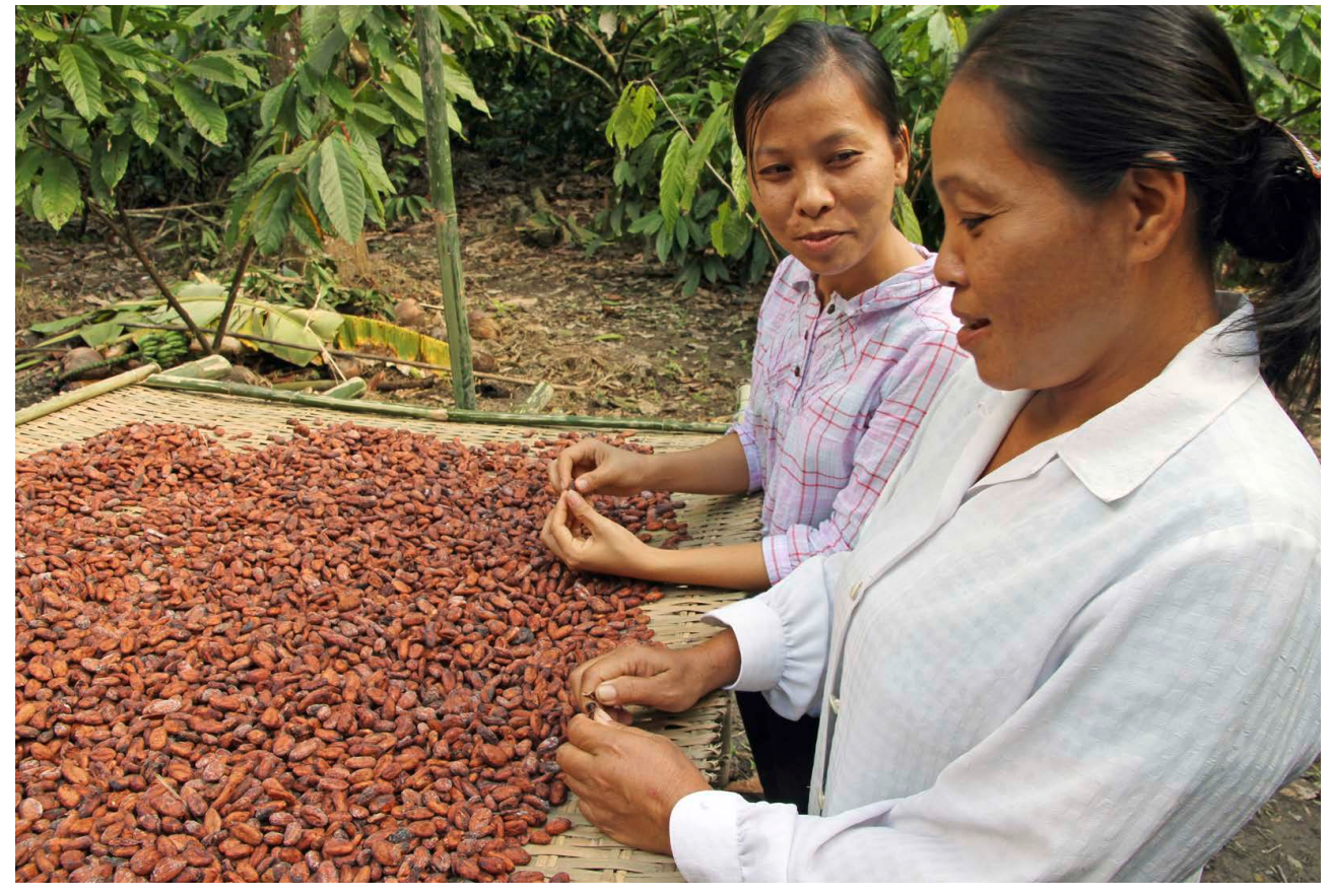
Women discussing on cocoa beans drying, Ben Tre Province, Vietnam.