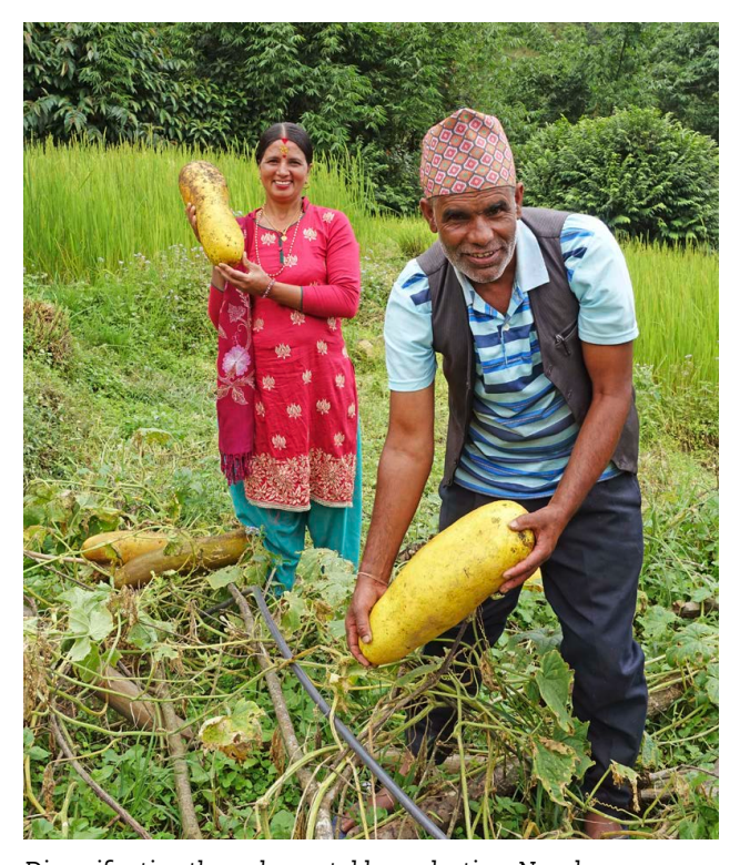
Diversification through vegetable production, Nepal.

Outcome 3.2: Resilience of women and young smallholder farmers are strengthened through safety nets and risk transfer mechanisms.