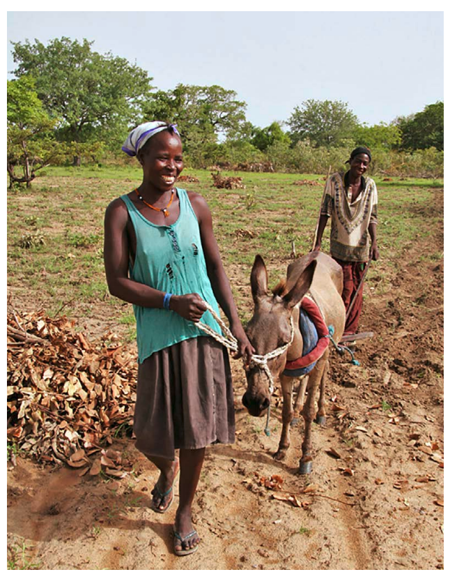
Animal traction ploughing, Burkina Faso.

Outcome 1.3: Development and implementation of international frameworks, voluntary guidelines or technical standards deriving from the right to adequate food. The GPFS focuses its interventions in relation to its three components on agroecology, markets and healthy nutrition.