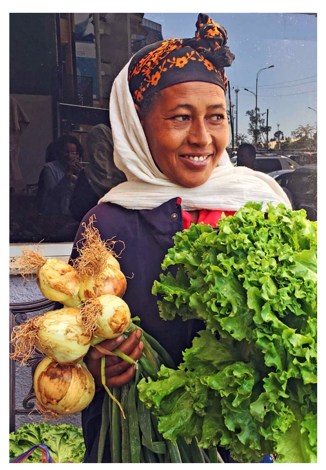
Organic vegetables market, Addis Ababa, Ethiopia.