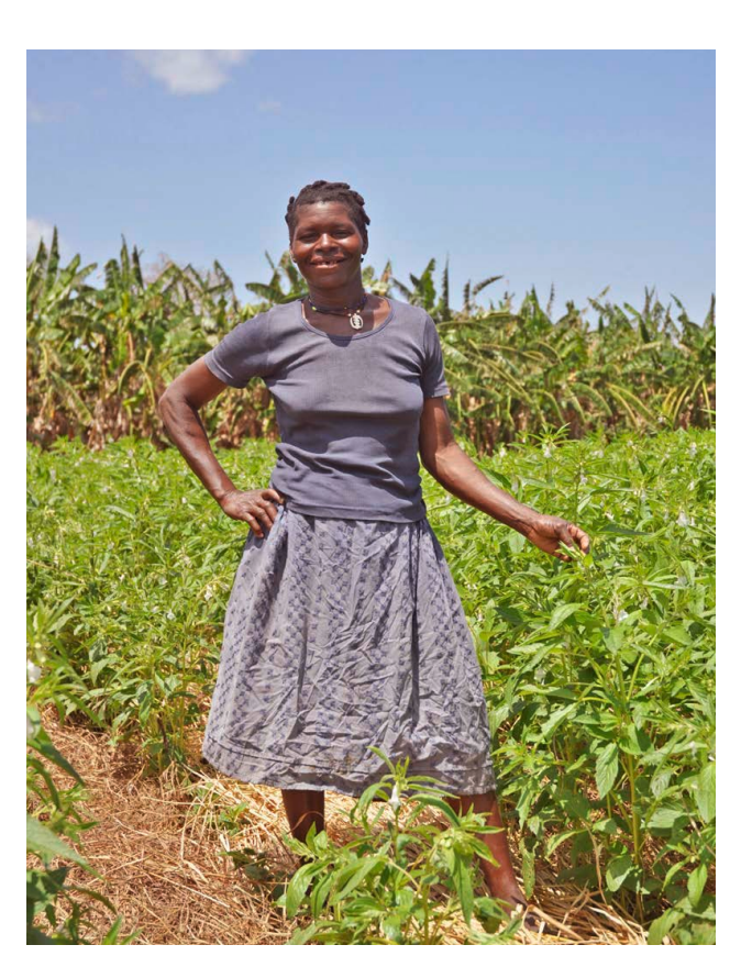
Woman farmer proudly showing her agroforestry field. Cabo Delgado, Mozambique.

Outcome 2.2: Co-creation and sharing of knowledge, including local and scientific innovation in the context of improving resource efficiency, increasing diversity and strengthening resilience. This will be addressed among other ways through youth- and gender-responsive rural advisory systems.