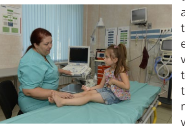
The SDC is helping Moldova to ensure that children in all regions of the country receive the best possible medical care.

chains including the regulatory framework and business support services that will lead to private sector growth thus creating more and better jobs.