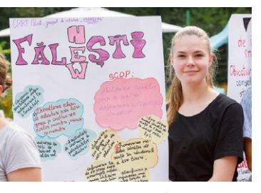
Proud youth group member of the civic education project is presenting the vision and planned activities in their community, summer camp, Moldova, 2019.