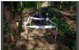
Switzerland's demining project in Croatia is helping to create a safe and protected environment for people living in mine-infested areas.

Mines and other explosive remnants of war are a dangerous legacy from the 1991–96 war in Croatia. Over 1.8 square kilometres of woodland near Kotoar-Starj Gaj was cleared of explosive devices and is now available for use again by the population. The Swiss–Croatian project also supports mine victims and their families. A national database of their needs is currently being compiled. Various activities are also planned for the economic and social integration of people affected.