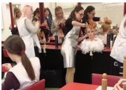
A modern vocational education and training system prepares young people better for the labour market.

In Croatia, Switzerland is contributing CHF 42.75 million to support ten projects over the period 2015–24. The following are the results achieved by the end of 2020.